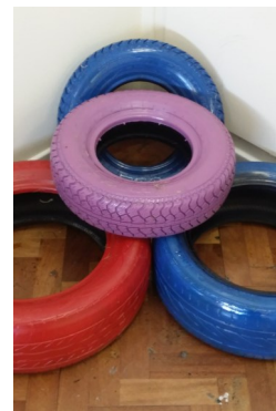
Tyres painted and ready to go.

The planters are on sale now, £15 for 1 or £20 for 2. Order one while stock lasts!