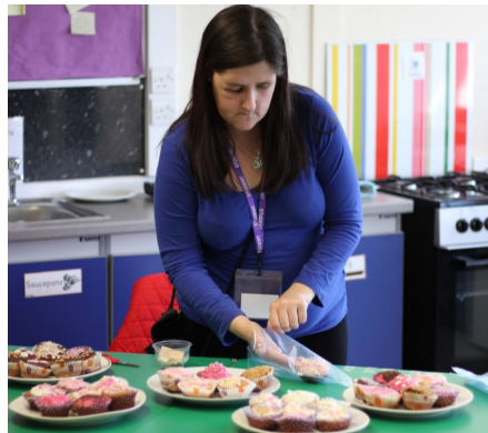
Student wrapping up one of the many fairy cakes sold.

Some of the fantastic products on offer included: cards, cakes and bird feeders. One group utilised our sensory pod to offer relaxation sessions which included a hand massage. The students raised over £130!