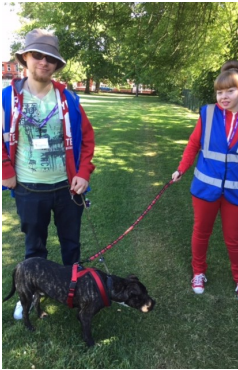
Students volunteering for Friends of Birkenhead Kennels.