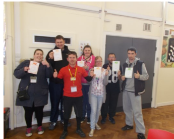
Students receiving their certificates.

Two students achieved a Level 3 certificate and passed a road safety test. As a result, they received free bikes, locks and safety equipment.