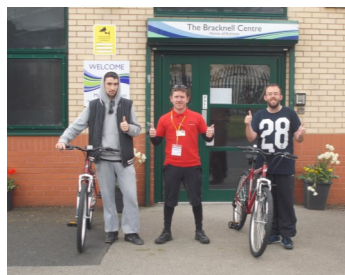
Students showing off their new bikes.

One of the students said, “Having this bike has made a huge impact on my life. I can get around a lot easier now.”