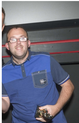
Student receiving the Director's Choice Award.

Two of our students won the Director's Choice Award and one received the Mary Hignett Award.